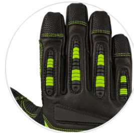
TPR reinforcements on back joints and fingers