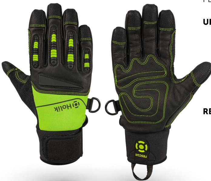
PENELOPE PLUS Green

Colour: ■ Lime Green PENELOPE PLUS Green 6517