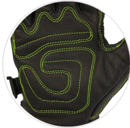
Goatskin leather with hydrophobic treatment